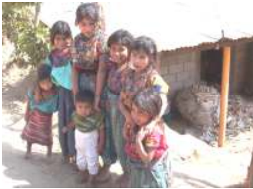
Children waiting for feeding center in Yalu...see harvested corn on the ground below. Sometimes tortillas are the only food eaten for days at a time.